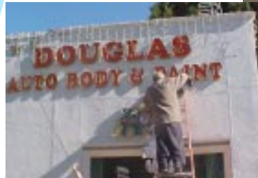
Every year Hagop Avedisian puts up the traditional holiday decorations.

for at least three days and sometimes more, if the driver's policy doesn't have rental car coverage.